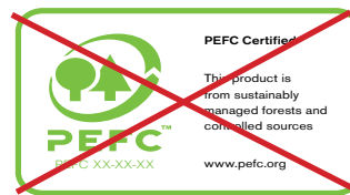
Do not stretch the label in any way