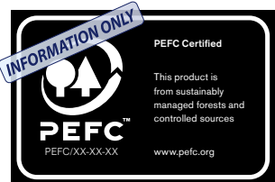
3. White on solid background