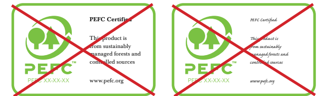
Do not change the typeface of the label content