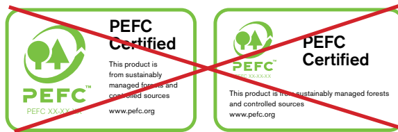
Do not change the proportions of the label content in any way

It is essential that the PEFC labels are reproduced consistently and correctly. The labels must not be altered in anyway except for the insertion of the logo license number, scaling, and modifications as outlined in Section B. Proportions of the label shall not be changed when increasing or reducing the label size.