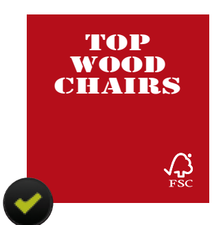
Logo is independent of other branding