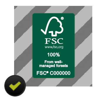
Use of the label on a regular patterned background