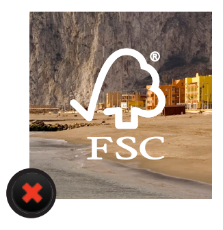
Use of the logo on a photographic background which goes through the logo design