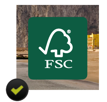
Logo with frame on a patterned or photographic background