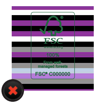
Use of the label on a patterned background that goes through the label