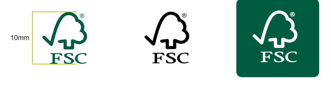
Green - Pantone 626C

Extra logo colors: green, black, and white. The color of extra logos follows the same color rules for the label.