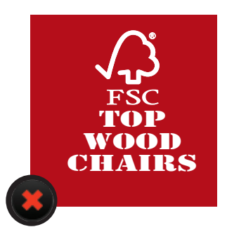
Misleading – logo used in combination with other branding